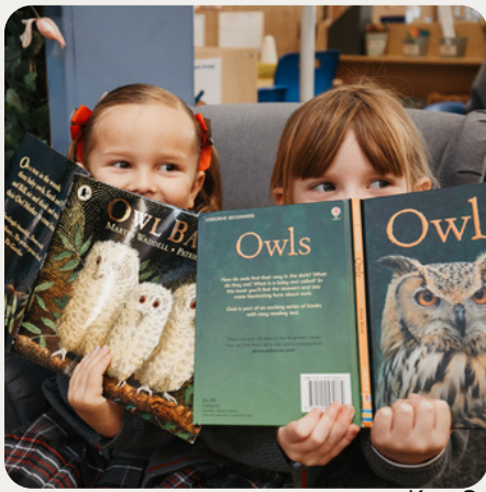
Key Stage One (Year One and Two)