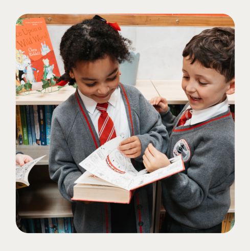
Key Stage One (Year One and Two)