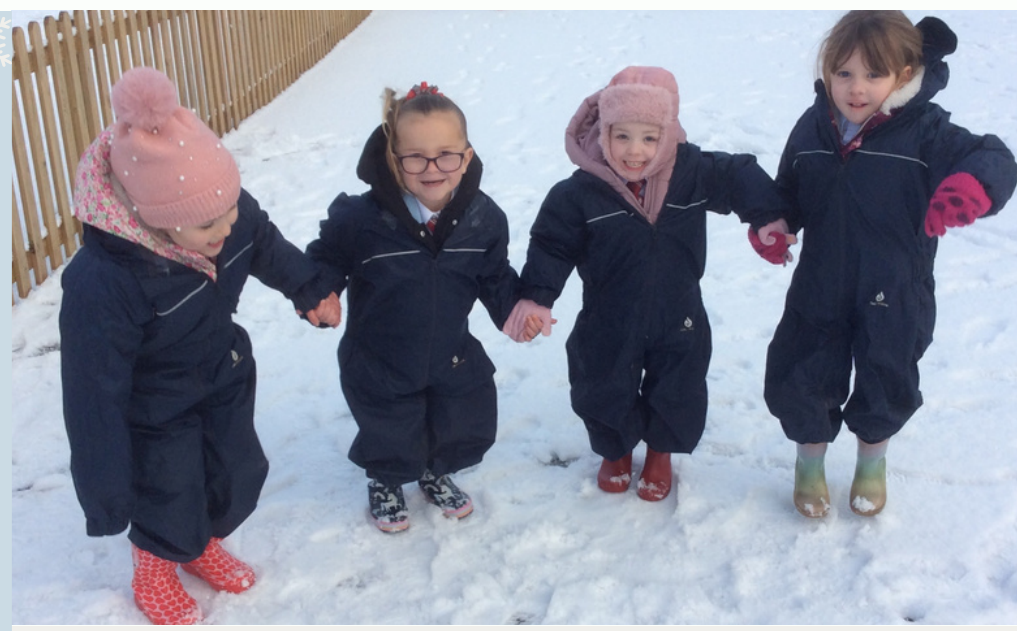
We have had a very busy start to 2024!

Children across every class have been working hard, looking through their books and seeing the progress they have made to date has been a lovely task for me over the last few week.